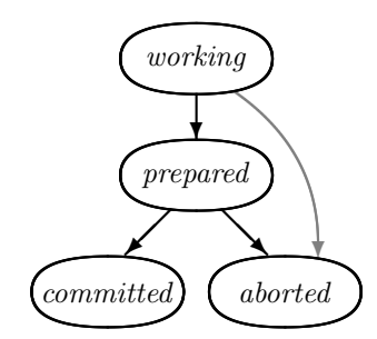
Figure 1: The state-transition diagram for a resource manager. It begins in the working state, in which it may decide that it wants to abort or commit. It aborts by simply entering the aborted state. If it decides to commit, it enters the prepared state. From this state, it can commit only if all other resource managers also decided to commit.

The goal of the algorithm is for all RMs to reach the committed or aborted state, but this cannot be achieved in a non-trivial way if RMs can fail or become isolated through communication failure. (A trivial solution is one in which all RMs always abort.) Moreover, the classic theorem of Fischer, Lynch, and Paterson [8] implies that a deterministic, purely asynchronous